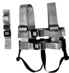
E-Z-ON modified vest

One option, for example, may be the Nania Airway; it can semi-recline and has low sides. This car seat unfortunately will be discontinued by the end of 2006. Any convertible seat with lower sides and a wider front may work. The hospital should have a variety of seats to try. You may want to look at the Britax Regent (formerly called the Husky), Roundabout, Marathon and Boulevard (formerly called the Wizard), the Dorel Alpha-Omega, the Combi Victoria or the Combi Avatar. Sometimes a small baby may fit into a car bed, depending on how their cast is made.