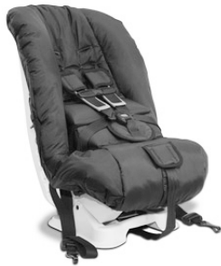
Snug Seat Hippo

The Hippo is a car seat that may be used rear-facing, semi-reclined, for a child who is between 5 and 33* pounds or forward-facing for a child who is over one year of age and between 20 and 65* pounds and a maximum of 49 inches in height. The Hippo must be installed forward-facing in the upright position if the child's weight is between 34 and 65* pounds, but may be installed forward-facing in the semi-reclined position for children less than 33* pounds. This seat must be tethered if the child is 40 pounds or more. It cannot be tethered in the rear-facing position like other Britax products. The Hippo is available at www.snugseat.com , and www.adaptivemall.com . (*Upper weight limit refers to casted weight)