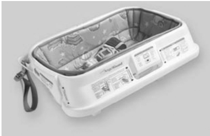
Angel Guard AngelRide

Your baby may be premature, has passed the Angle Tolerance Test in the NICU, is able to ride in a car seat, instead of a car bed but is still under 5 pounds at discharge; he or she may be able to fit a Graco Assura, the Chicco Keyfit, or the Compass 1-420.