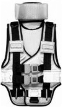
Safe Traffic Systems RideSafer vest