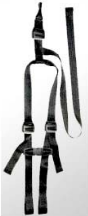
E-Z-ON Kid-Y harness