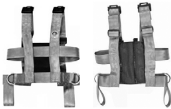
E-Z-ON zipper vest (front and back)

Some older children with behavioral challenges may be transported in a conventional booster seat, or by combining a booster seat and a vest. One option may be the Ride^Ryte booster seat, used in combination with the E-Z-ON Kid-Y harness (the Kid-Y harness cannot be used alone). Details about this booster seat and the harness are available at both www.safetyangel.com and at www.ezonpro.com . You will be referred to a distributor in your area. Boosters lift your child up, may be more comfortable, give a better view out the car window, and improve your child's attitude about being restrained.