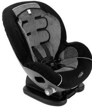
Evenflo Triumph V

It is a good idea to work with a rehabilitation therapist when selecting and ordering an adaptive restraint that best meets your child's positioning needs. Since a large medical seat is much more expensive than a standard seat, the therapist can also help you get funding from a "third-party payer" such as medical insurance, California Children's Services, or a charitable or service organization like United Cerebral Palsy or Kiwanis.