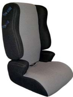
Ride^Ryte booster seat