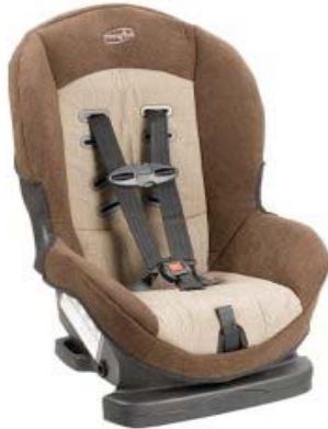
Evenflo Titan V

A child with Down syndrome may have low muscle tone. In some children, the first and second vertebrae in their neck move easily. A rear-facing car seat will better protect your child's head, neck and spine.