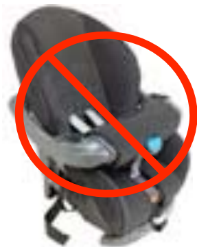
Do not use a car seat with a shield if your child has a tracheostomy.