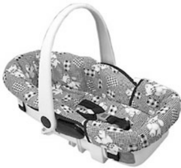
Cosco Ultra Dream Ride