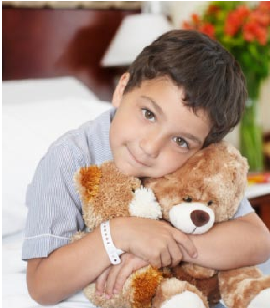
When it comes to rare cancers, such as germ cell tumors in children and adolescents, it's critical to choose a treatment facility that specializes in that specific disease.

usually occur in the ovaries and testes, but they can also be found in other parts of the body, such as the brain." The stage for germ cell cancers is set before birth. Most germ cells migrate to the reproductive organs when the embryo is developing. According to the American Cancer Society (ACS), about 10 percent of germ cells fail to make this journey and end up in the head, chest or upper back of the developing fetus. Later in life, tumors may develop in the areas of the reproductive organs and other parts of the body where the germ cells migrated.