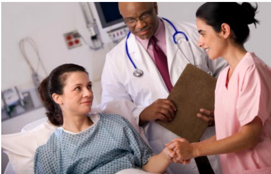
As cancer deaths continue to decline in the United States, more Americans are now surviving cancer than ever before.

IN 1971, PRESIDENT RICHARD NIXON LAUNCHED A WAR ON CANCER, A GROUP OF MORE THAN 100 DISEASES CHARACTERIZED BY UNCONTROLLED GROWTH AND SPREAD OF ABNORMAL CELLS. IN HIS STATE OF THE UNION ADDRESS, HE CALLED FOR $100 MILLION IN FUNDING TO FIND A CURE. CONGRESS RESPONDED BY CREATING THE NATIONAL CANCER ACT TO SUPPORT BASIC RESEARCH AND CLINICAL TRIALS. ALTHOUGH A CURE HAS YET TO BE FOUND, NEW SCREENING TOOLS FOR BREAST, PROSTATE AND OTHER CANCERS ARE HELPING TO