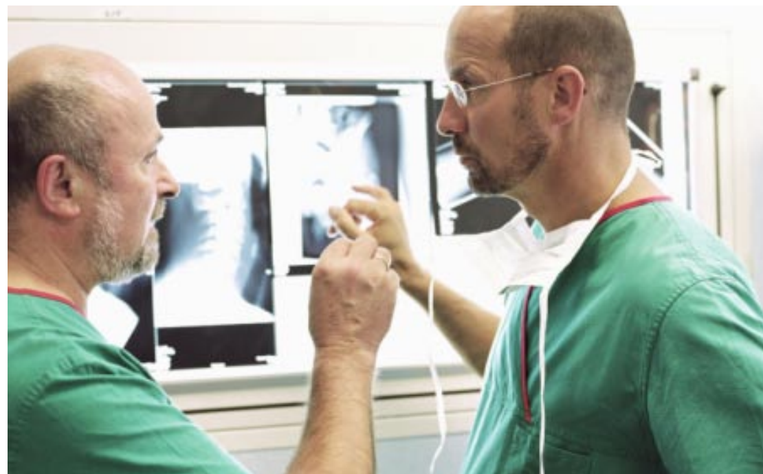
As if lung cancer weren't enough of a reason to kick the habit, smoking is also a major risk factor for head and neck cancers, which afflict some 50,000 Americans each year.

Because it attracts so many patients, the center takes part in clinical trials. For example, one trial is investigating the use of a potent raf-kinase inhibitor in the treatment of metastatic thyroid cancer. "Our department is also doing research in the genetic basis for head and neck cancer," Dr. O'Malley says. "We expect these studies to result in new ways to treat head and neck cancers with vaccines, so patients will have more options."