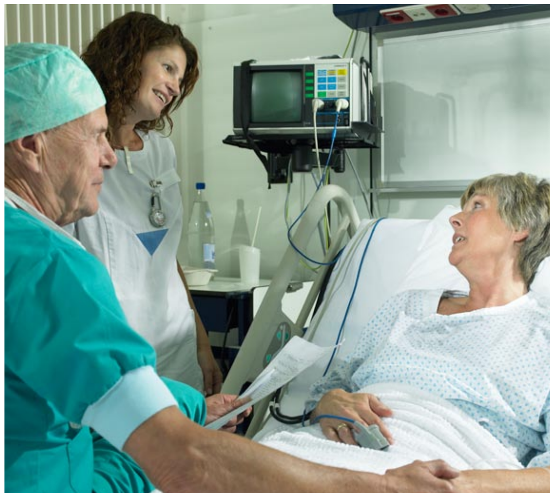
A promising vaccine that trains a patient’s own immune system to target ovarian cancer cells offers hope in the treatment of this notoriously difficult malignancy.

Early studies of the vaccine’s effectiveness have been encouraging. The team tested the experimental anti-tumor vaccine in 18 women who had completed surgery to remove their ovarian cancers and who were receiving chemotherapy to destroy any remaining cancer cells. The vaccine did not cure the cancer, but it did get the immune system to make anti-