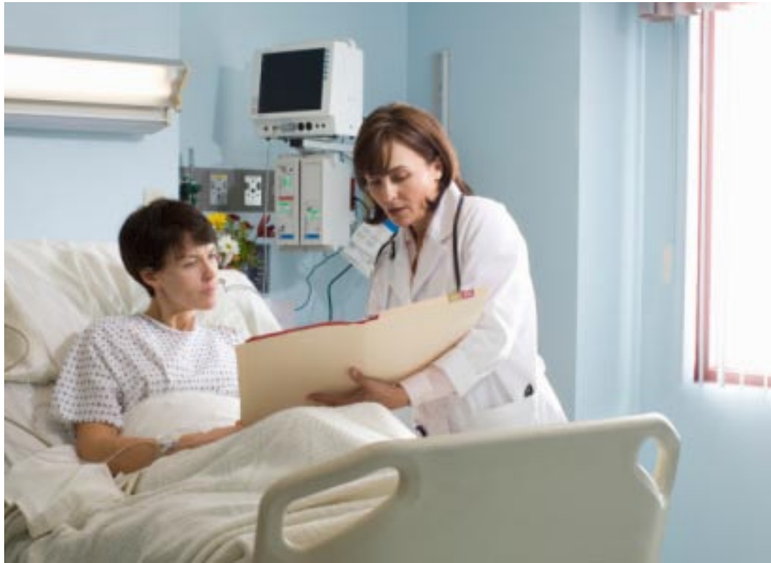
A precipitous rise in melanoma rates among young American women highlights the need for increased education and vigilance.

Because the team at Henry Ford is a world leader in the procedure, its results are outstanding. In addition to less blood loss and scarring, patients have better outcomes in sexual function and urinary continence than patients who have the traditional open prostatectomy. When the prostate is removed, one of the two muscles that normally control urination is also removed. The second muscle will compensate for the first muscle over time. Most men who have prostate surgery have mild to moderate urinary leakage that may last from 6 to 12 months, but with the robotic prostatectomy technique, they regain continence much faster. The team also reports significant patient benefit in another key respect. “We have developed a new variation of the robotic prostatectomy called the Veil of Aphrodite that offers added protection to the nerves, which play an important role in penile erections,” says Dr. Menon. “As a result of this technique, many patients have had earlier return of and better quality erections as well as better urinary control.”