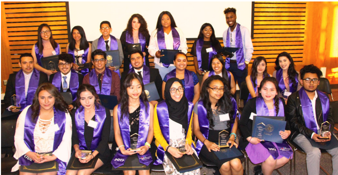
28 CHAMPS students graduated from the program in May 2017.

FCN has been instrumental in achieving a ZERO mother-to-child transmission rate in Alameda and Contra Costa counties among women in care since 2007.