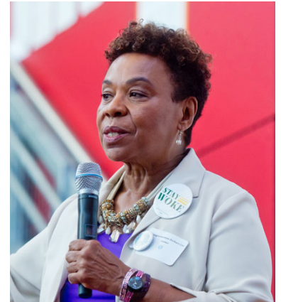
Congresswoman Barbara Lee (CA-13) spoke at the "All Are Welcome" forum.