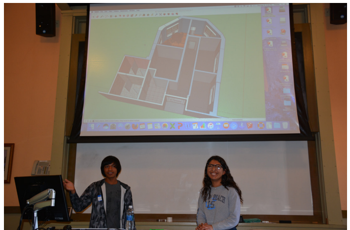
Future Builders students showcase their projects.