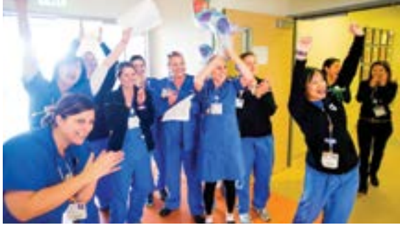
Medical staff planned a cheerful welcome to pediatric patients as they arrived.

With 40 ambulances, approximately 300 UC San Francisco staff and faculty, as well as 100 emergency medical services personnel, UCSF Medical Center on February 1st, safely transported 131 patients to the new UCSF Medical Center at Mission Bay from its Parnassus and Mount Zion campuses.