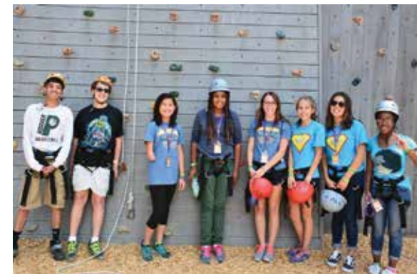
Fearless teens at Camp Winning Hands prepare for the ropes course and climbing wall. The overnight camp allows children and teens with hand differences to play and explore in a safe environment.

Ah, summer camp. The swimming, the sing-a-longs, the s'mores by the campfire. What child wouldn't benefit from the fun and freedom that camps provide?